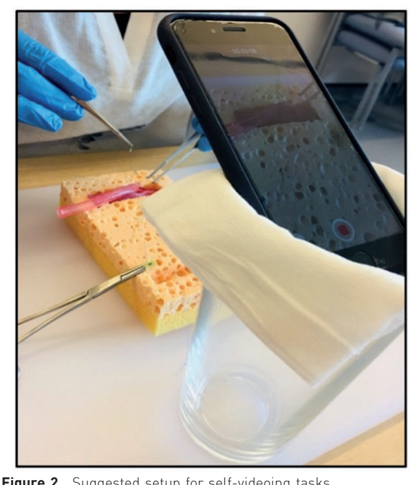
Figure 2. Suggested setup for self-videoing tasks.

8 trainees (33%) had never previously performed a complete end-to-side anastomosis and only 1 (4%) trainee had performed 11 or more. Trainee self-rated confidence in performing arteriotomy with patch repair and end-to-side anastomosis before the VASIMULATION programme is shown in Table 2.