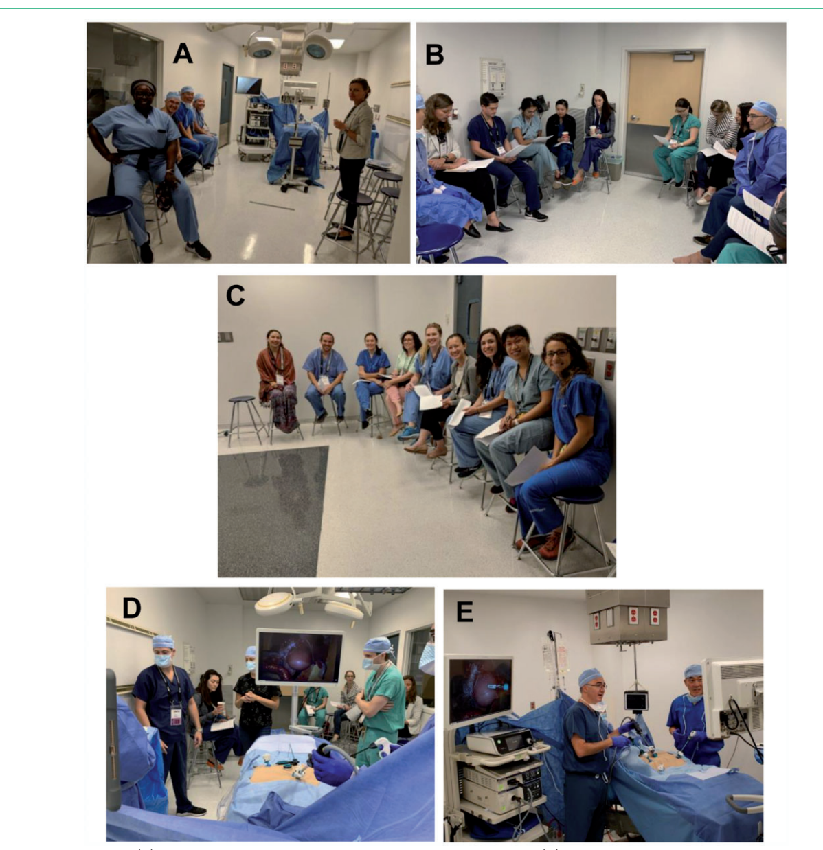
Figure 2. Room setup. (A) The simulation space with setup before participants arrive. (B) The pre-briefing when going over the details of the clinical case before simulation starts. (C) Observers and faculty behind the invisible wall. (D) The simulation in progress as seen by an embedded anesthesiologist from behind the drapes. (E) The simulation in progress as seen by a participant.

of the bleeding vessel with the pump turned on. Due to the need to travel, the entire box including the pump and ports was shipped to the course site from a remote location. Supplementary Video 1, Fig. 3, and Box 3 provide a stepby-step description of the abdomen components and assembly along with the cost. Supplementary Video 1 shows a laparoscopic view of the bleeding vessel as it occurs during the simulation.