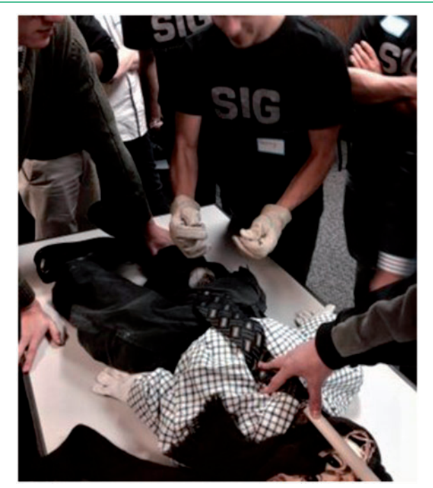
Figure 3. Learners practicing vessel ligation on the VETAS during the surgical skills workshop. The PVC housing through which the simulated tibia and tibial artery are advanced is visualized in the lower right-hand corner.

Table 1. Five-point Likert scale ranked responses to the general workshop and amputation-station-specific questionnaire (n = 53)