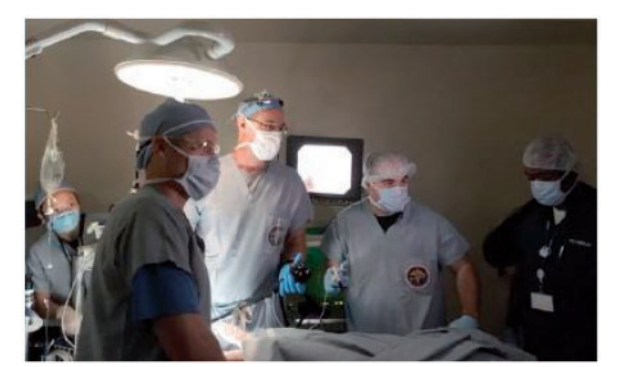
Figure 1. Combined endoscopy team with gastroenterologist, general surgeon, and trainees working in the vivarium.

We established a task force from our Combined Endoscopy Center (CEC) to develop optimal POEM training led by an expert interventional gastrointestinal endoscopist (RDL) and an advanced minimally invasive surgeon (GGW) experienced with NOTES and surgical endoscopy. Our CEC facility offers a unique environment where general surgeons and gastroenterologists share the clinical space and perform diagnostic and therapeutic endoscopy side by side. This