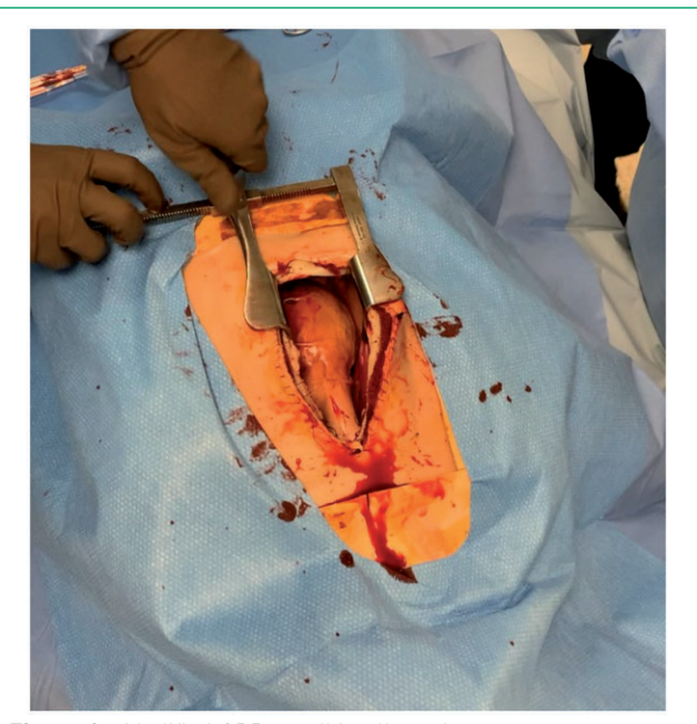
Figure 2. Modified CPR manikin allows for resternotomy, including incision reopening, cutting sternal wires, and retraction of the sternum.

and chi-squared tests to evaluate pre- and post-training changes in the proportion of people who answered each question correctly. We used linear regressions to examine relationships between participant discipline, experience level, and previous performance of a resternotomy on baseline test scores. We characterized participant experiences and perspectives using six subjective questions. The subjective questions were measured on 5-point Likert scales with higher values corresponding to positive/favorable emotions and lower values corresponding to negative/unfavorable emotions. Differences in subjective measures before and after training were calculated using numerical equivalents and tested using Wilcoxon rank-sum tests (a non-parametric two-sample t test equivalent). For all analyses, we used R Studio, version 3.6.1 (R Foundation for Statistical Computing; Vienna, Austria) and assessed statistical significance at \alpha = 0.05 . Summary statistics are presented as means \pm standard error (SE).