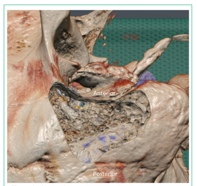
Figure 1. CardinalSim rendering of a dissected cortical mastoidectomy and facial recess dissection. The horizontal semicircular canal (*) and the short process of the incus (^) are used to determine the position of the facial nerve (vertical/mastoid segment). The facial recess is demarcated by the facial nerve (%), chorda tympani, and the incus buttress (#). The round window membrane (~) is visible with the niche having been drilled away.

CardinalSim, a patient-specific VR surgical simulator, integrates clinical diagnostic imaging and has demonstrated